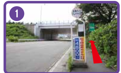
Get off at Nyotai-Iriguchi Bus Stop. Walk a little to the east and there will be a walkway on your right.