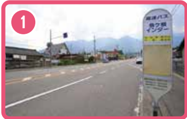
Photo of the Komagane Interchange Expressway Bus Stop. You will need to use a different bus stop for your return trip.