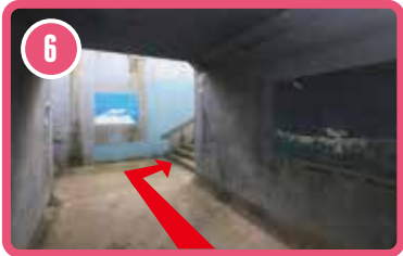
Turn right at the end of the underground passageway.