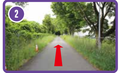
Follow the walkway.