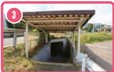
Use the underground passageway to cross the street.