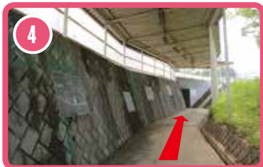
Keep walking straight.