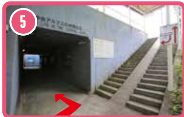
Turn left and walk through the underground passageway.