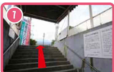
Walk up the stairs.