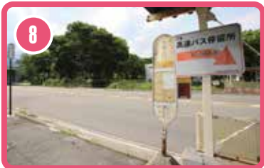
The Nyotai-Iriguchi Bus Stop is located immediately after emerging from the underground passageway. Take the Route bus from this stop to the ropeway.