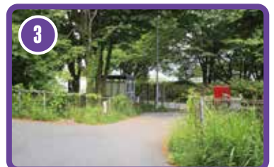
The Komagane Interchange Expressway bus stop is located at the bend in the walkway.