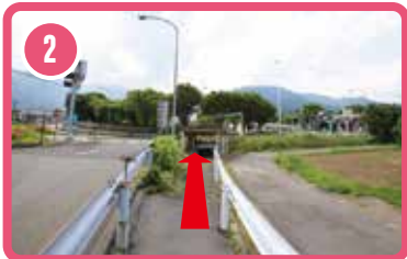
Walk along the path located to the west (toward the Komagane Interchange).