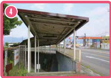
4 Use the underground passageway to cross the street.