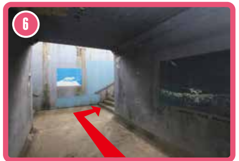
6 Turn right at the end of the underground passageway