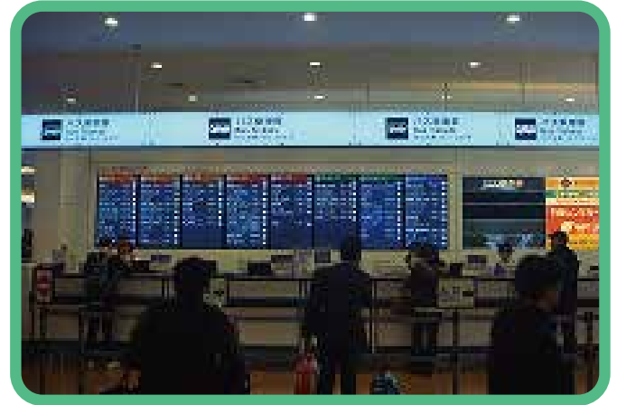
2 Purchase a ticket for Shinjuku Expressway Bus Terminal