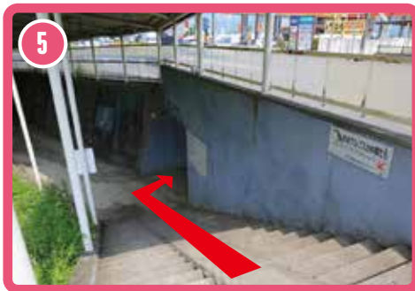
5 Walk down the stairs and turn right for the underground passageway.