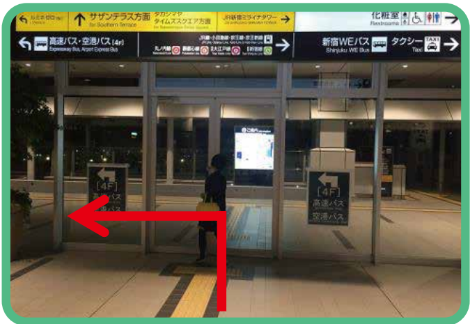
5 Take the escalator to the fourth floor.