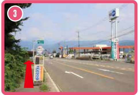
3 Turn left and head east (toward the Komagane Interchange)