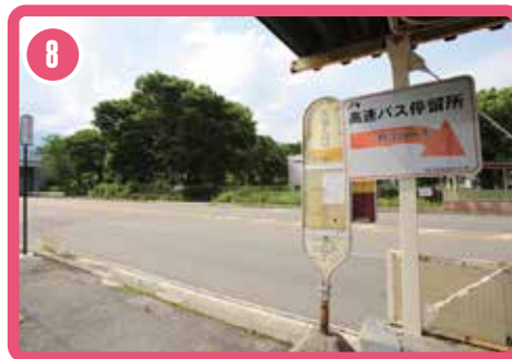
8 The Nyotai-Iriguchi Bus Stop is located immediately after emerging from the underground passageway. Take the Route bus from this stop to the ropeway.