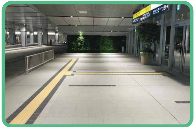
4 Arrive at the Shinjuku Bus Terminal expressway bus stop. (third floor)