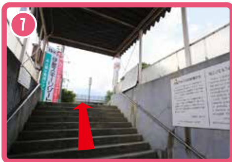
7 Walk up the stairs.