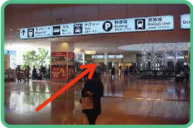
1 Walk to the bus area from the Arrival Lobby.