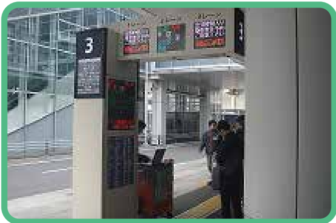
3 Take the limousine bus from Bay 3. (about 35 min.)