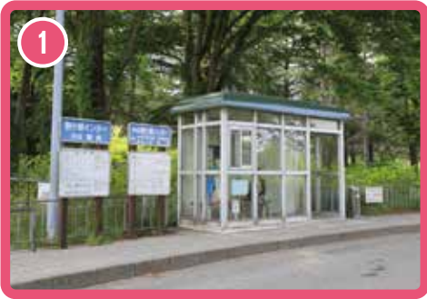
1 Photo of the Komagane Interchange Expressway Bus Stop. This bus stop will be used for both arrivals and departures.