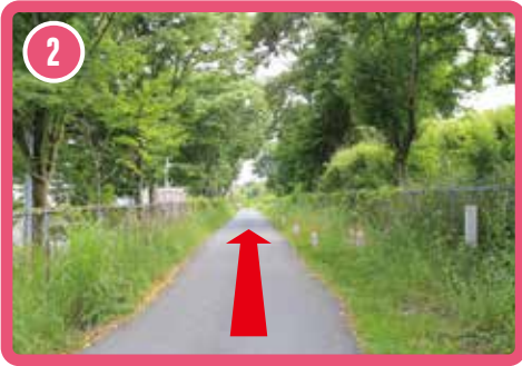
2 Walk along the path located to the west. This will take you to a large street.