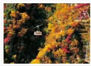
The ropeway car passes between mountains bathed in brilliant autumn colors

The trail from Senjojiki Station to Komagatake is a popular 1-day climbing route for beginners, taking about 4 hours roundtrip. The weather in the mountains, however, can change at any time, and even in summer the average temperature during the day hovers around 12°C (53.6°F). It can be particularly cold in the shade, so it is essential to dress warmly. Appropriate shoes for climbing, gloves, cap and raingear are also a must. Climbers must be particularly careful during the winter months and at times when there is still snow on the ground. The texture of the snow is affected by the weather and changes constantly. Climbers should remember that there are hazards all around them and proceed in a manner that suits their stamina and skills.