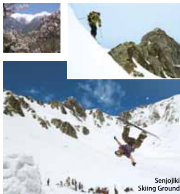
Senjojiki Skiing Ground : Open from late April through late May

When the cherry blossoms are blooming in the foothills, the mountains are still covered with snow. Senjojiki Cirque is transformed into a ski ground, attracting skiers and snowboarders from all over Japan. Many people also enjoy mountain climbing amid the lingering snow, while in the foothills this is the best time to see the rosebud cherry trees (kohiganzakura) at Takato-joshi and weeping cherry trees (shidarezakura) at Kozenji Temple. Around Komagatake too, May through June is when the mountain cherry trees and alpine plants begin to bloom.