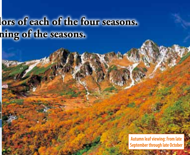
Autumn leaf viewing: From late September through late October