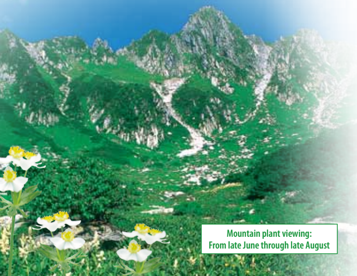
Mountain plant viewing: From late June through late August

While the air is pleasantly cool in the mornings and evenings, the blistering sun beats down during the day. Visitors are captivated by the pretty flowering alpine plants that bloom exquisitely in the harsh natural environment.